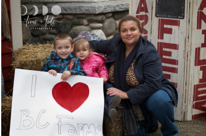
Qualicum Beach Farmers Market's photo booth.

We always love to see how you engage your shoppers and vendors during Farmers Appreciation Week, so thank you for sending your photos along. We've compiled them into a Facebook photo album and encourage you to take a peek (there are some very creative cakes!) Send along any additional photos you have and we'll add them to the album. Email photos to: info@bcfarmersmarket.org